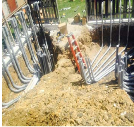
Shown above is conduit installation for secondary cabinets.

The remainder of the contract covered the final steps necessary for the removal of the substation that was previously located by the entrance to the City Park just south of the Aquatic Center. This work consisted of installing a padmount switch, padmount transformer and sectionalizing cabinet along with new underground cables and splicing into